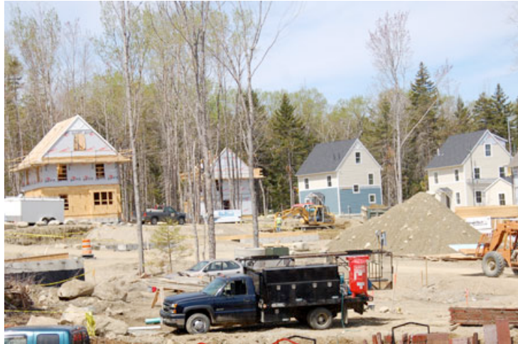
Several more foundations, now under construction, will complete this section of "walk-to" houses, one part of the Northeast Creek Neighborhood being developed by the Bar Harbor Housing Authority.

BAR HARBOR — The Northeast Creek Neighborhood, the workforce housing development now under construction in Town Hill, is a beehive of activity these days. Everywhere crews in orange hardhats work bucket loaders, dump trucks, and backhoes, and the sounds of hammering, stapling, sawing, and beeping from reversing trucks fill the air.