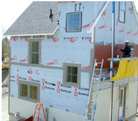
A worker for Bowman Brothers Construction installs cement board siding on a house at the Northeast Creek Neighborhood recently. Cement board is a more expensive, but more environmentally-friendly option than vinyl siding.